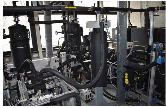
Figure 3. SCARLETT facility – testing of heat exchanger plates as part of the sCO_2 effort

and Toshiba and is undergoing commissioning at a site in La Porte, Texas.